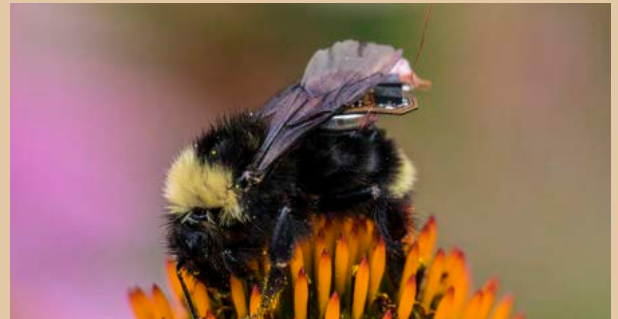
UW researchers have created a sensor package small enough to ride aboard a bumblebee.