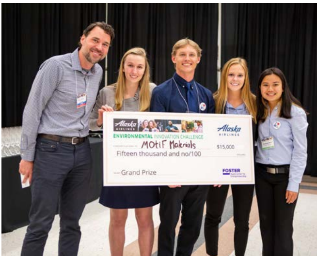
MOtiF Materials won first place at the 2019 Alaska Airlines Environmental Innovation Challenge.